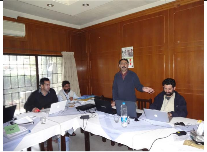
Participant asking a question