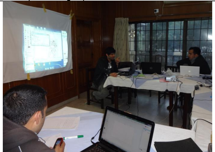
Hayat presenting GIMP